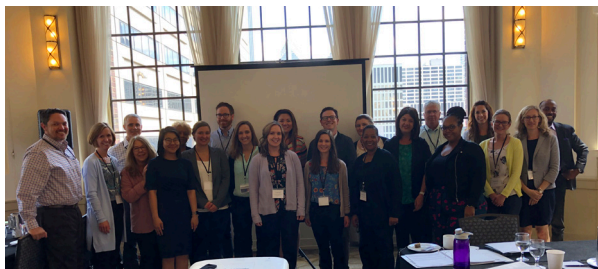
LEO and Stand Together work together to create impact at a meeting in Chicago.